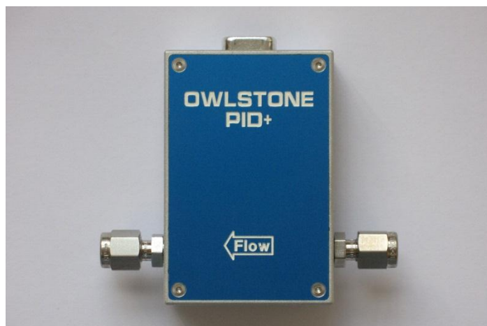
Figure 1: Front view of PID+ (note direction of flow)