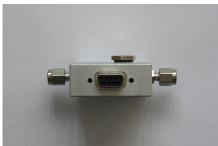
Figure 3: Top view of PID+ showing connector