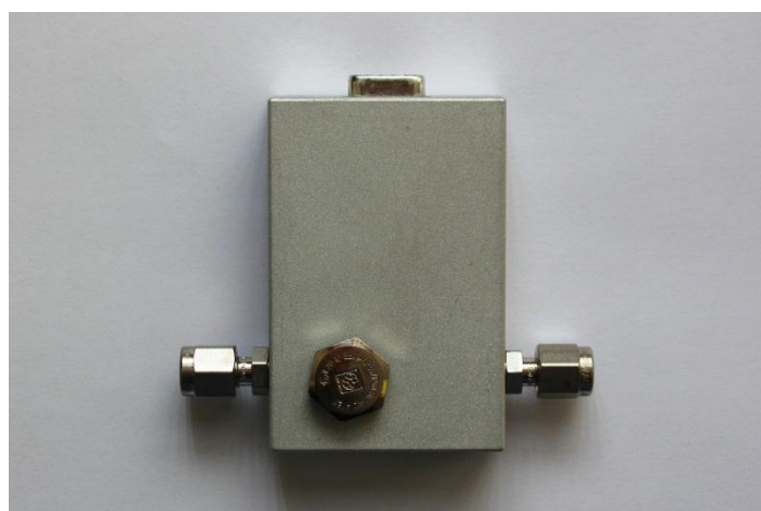
Figure 2: Back view of PID+ showing lamp access